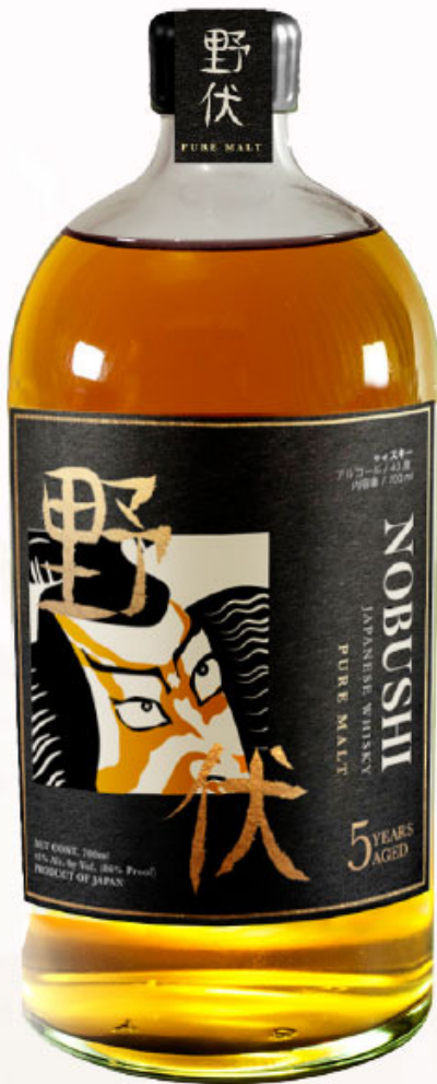
NOBUSHI PURE MALT 750ML - $75.99 (USD)