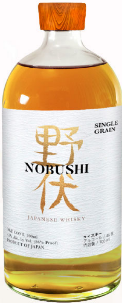
NOBUSHI SINGLE GRAIN 750ML - $65.99 (USD)