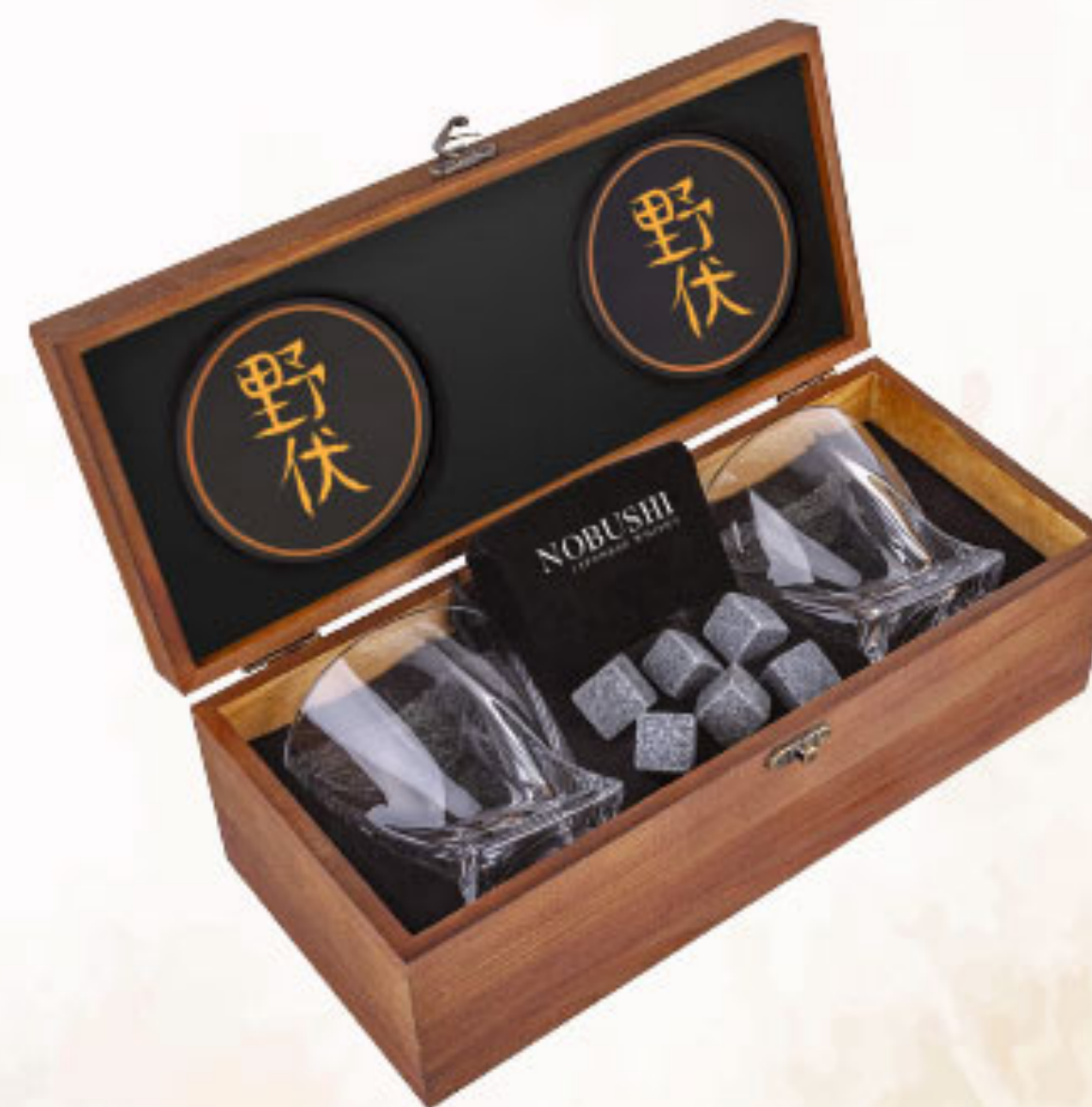
ROCK & GLASS PACK