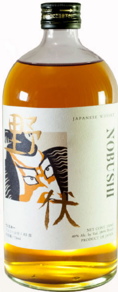
NOBUSHI BLENDED WHISKY 750ML - $39.99 (USD)