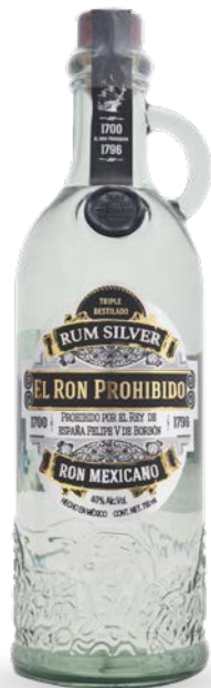
EL RON PROHIBIDO SILVER 100ml / 10cl / 70cl 75cl / 1L / 1.75L

Are a premium rums produced under a solera positioning system with 12 & 15 American oak barrels previously used for raisin wine. Aging in barrels that have been toasted in a traditional way gives this rum the dry tones and pleasant aromas that evoke once forbidden flavors. The truly distinctive taste is from the original rescued Recipe of the XVIII century, which is acquired through the combination of different blended rums aged in used sweet wine barrels resulting a blend of a wide range of flavors and delicious scents.