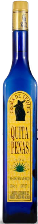
CREMA DE TEQUILA QUITAPENAS 100ml / 1L / 3L

Quita Penas was created in 1985 and has since established itself as a soothing and uplifting tequila variety made the way great things are: with plenty of patience, time and tradition, and without haste or wasted energy. Authenticity and Mexican tradition are fundamental ingredients of this great family of 100% agave tequilas, which embody Mexican craftiness and folklore and are an essential part of the Corralejo family, based in Pénjamo Guanajuato. Quita Penas tequila makes sad people happy, rejuvenates the old, inspires the young and makes one forget their weariness and fatigue.