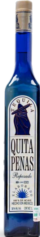
QUITAPENAS REPOSADO 100ml / 1L