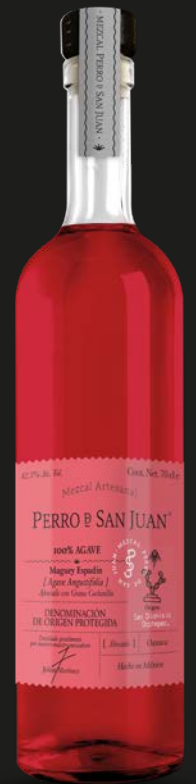
PERRO DE SAN JUAN GRANA COCHINILLA 70cl / 750ml