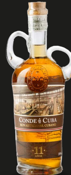
CONDE DE CUBA 11 años