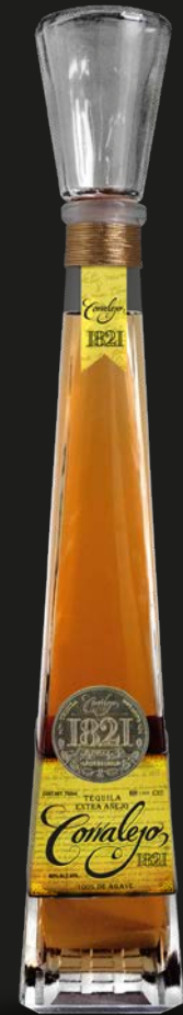
1821 EXTRA AÑEJO 750ml