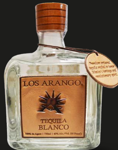
LOS ARANGO BLANCO 70cl / 750ml