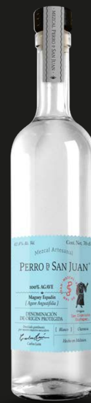
PERRO DE SAN JUAN AZUL 70cl / 750ml