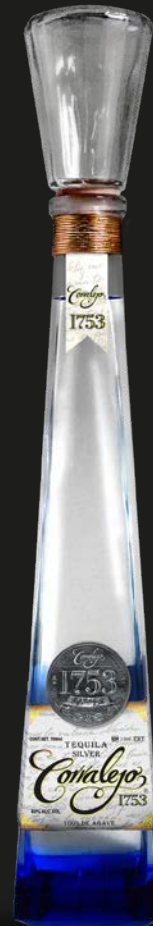
1753 SILVER 750ml