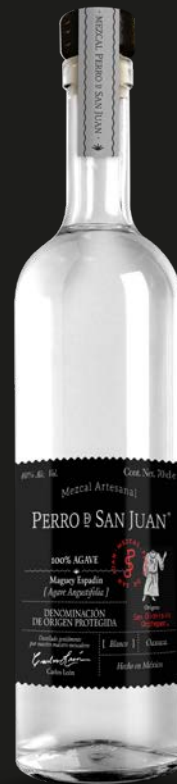
PERRO DE SAN JUAN 70cl / 750ml

Mezcal Perro de San Juan is born out of the pleasure for sharing and having new experiences with the people around us, for understanding and respecting different cultures and beliefs; above all else, for having learned to value life for its experiences, not its appearances.