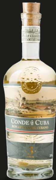
CONDE DE CUBA 3 años