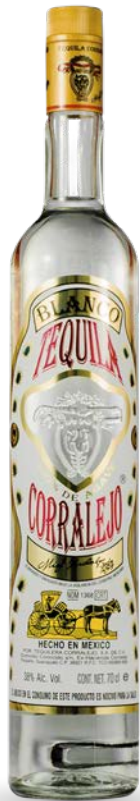
TEQUILA CORRALEJO BLANCO 100ml / 70cl / 750ml 1L / 10cl

Corralejo crafts authentically Mexican tequila that overdelivers on taste. Whether you're making around of margaritas or ordering shots to get the celebration started, Corralejo draws people together and sets the tone for a lively and vibrant experience.