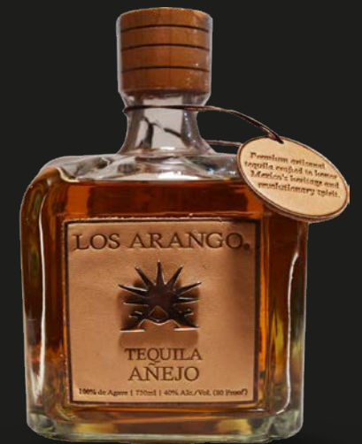
LOS ARANGO AÑEJO 70cl / 750ml