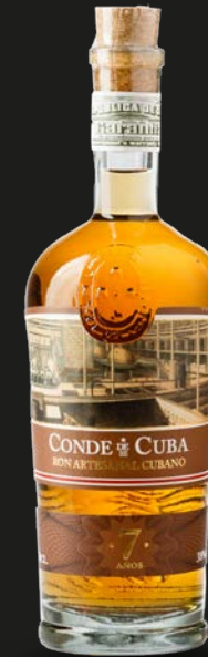
CONDE DE CUBA 7 años