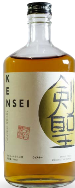
KENSEI 700ml / 750ml