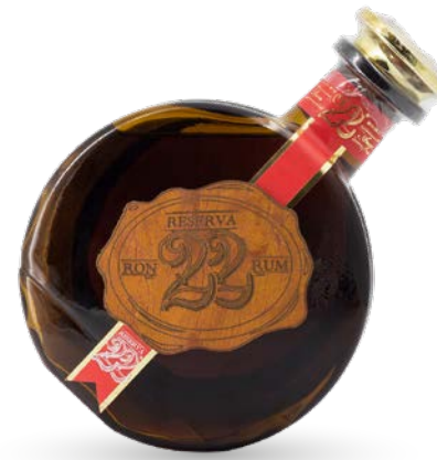
RESERVA 22 100ml / 10cl 70cl / 750ml