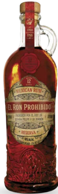
EL RON PROHIBIDO 12 RESERVA 100ml / 10cl / 70cl 75cl / 1L / 1.75L