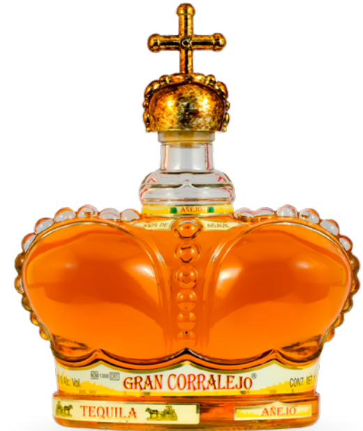
GRAN CORRALEJO 1L