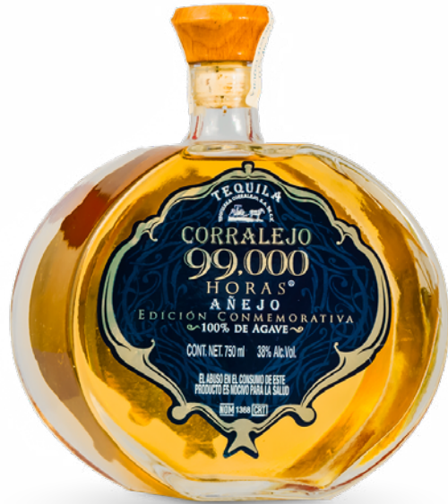
AÑEJO 99000 HORAS 100ml / 10cl / 70cl / 750ml