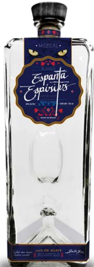
ESPANTA ESPÍRITUS 70cl / 750ml

The Guachichiles were one of the six town-villages from the Chichimeca's ethnic group sitted in the mexican states of San Luis Potosí, Zacatecas, southern Cohahuila and the northern part of Jalisco. They were seen as the bravest and nomadic in the region, who fought courageously against European conquest attempts who were domained at the end by the Guachichiles.