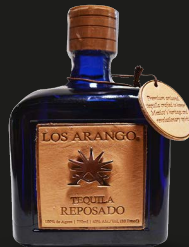
LOS ARANGO REPOSADO 100ml / 10cl / 70cl / 750ml