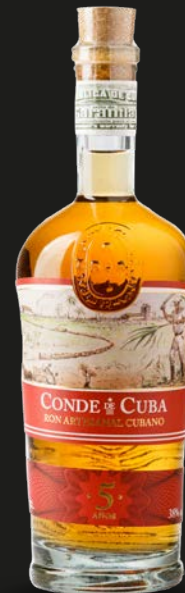
CONDE DE CUBA 5 años