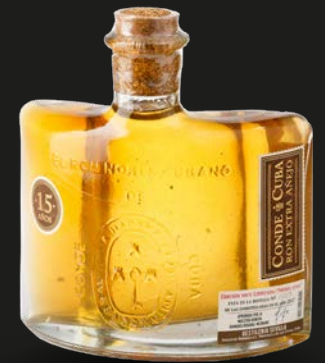
CONDE DE CUBA 15 años