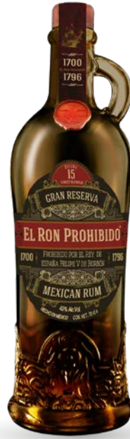
EL RON PROHIBIDO 15 GRAN RESERVA 100ml / 10cl 70cl / 750ml