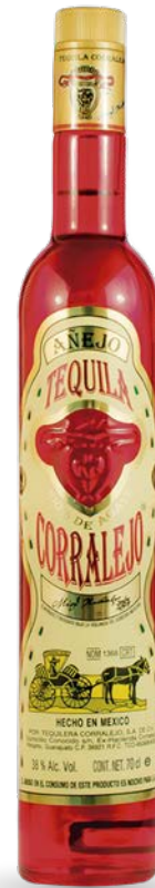
TEQUILA CORRALEJO AÑEJO 100ml / 70cl / 720ml 1L / 10cl