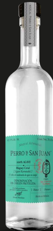
PERRO DE SAN JUAN CIRIAL 70cl / 750ml