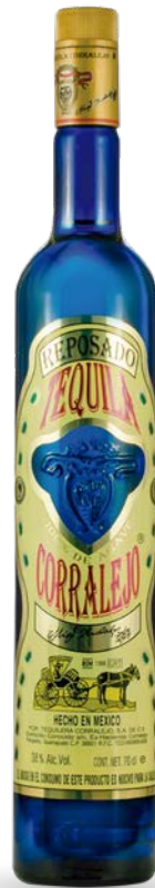
TEQUILA CORRALEJO REPOSADO 100ml / 10cl / 375ml / 70cl 750ml / 1L / 1.75L / 3L