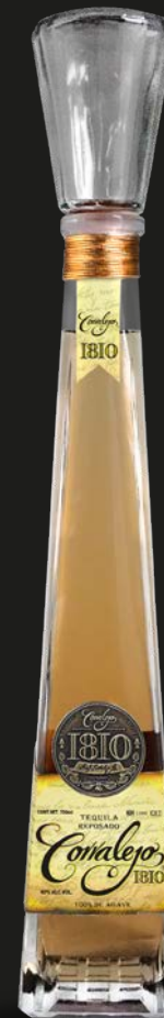
1810 REPOSADO 750ml