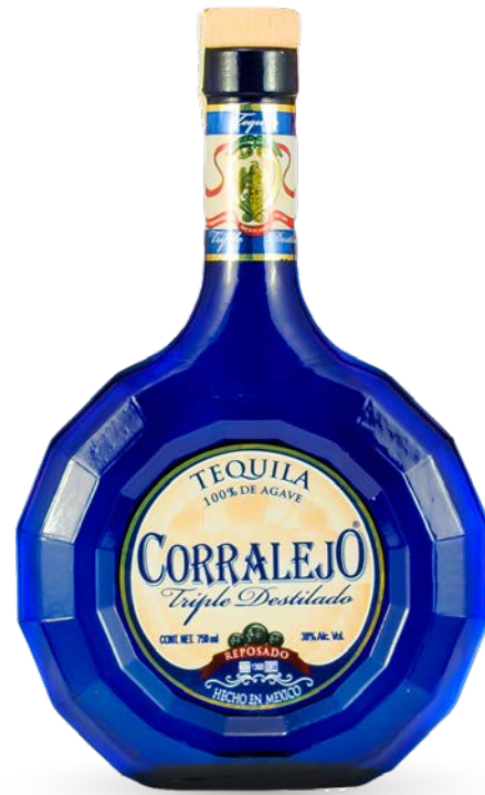
CORRALEJO TRIPLE DESTILADO 100ml / 10cl / 375ml / 70cl / 750ml