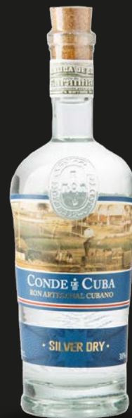
CONDE DE CUBA Dry Rum