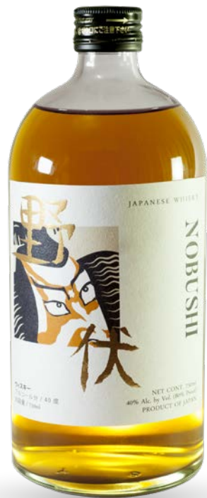
NOBUSHI 700ml / 750ml

The Kiyokawa distillery was created with an appreciation for the traditions of the Samurai. Overtime people realized that the water from the Kiyokawa mountains was so pure and crystalline that in combination with a methodical, traditional and high quality process, they could obtain a whisky that could pay homage to the tradition of seeking perfection, so engrained in samurai culture.