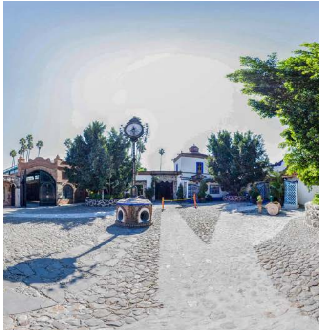
HACIENDA CORRALEJO MEXICO

We were born to serve, project and capitalize on the latent need for premium Mexican products with great potential in the international market.