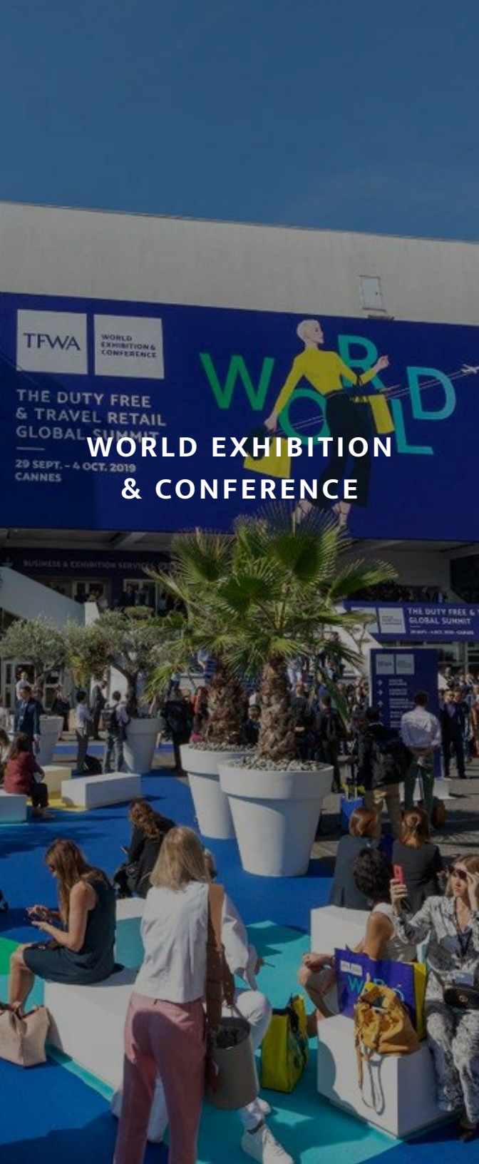
WORLD EXHIBITION & CONFERENCE