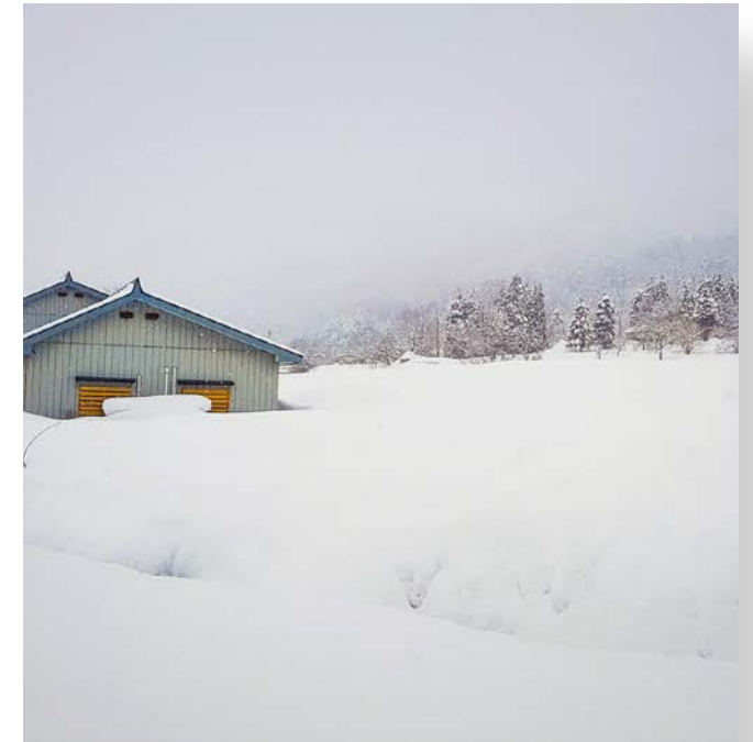
KYOKAWA CO., LTD JAPAN